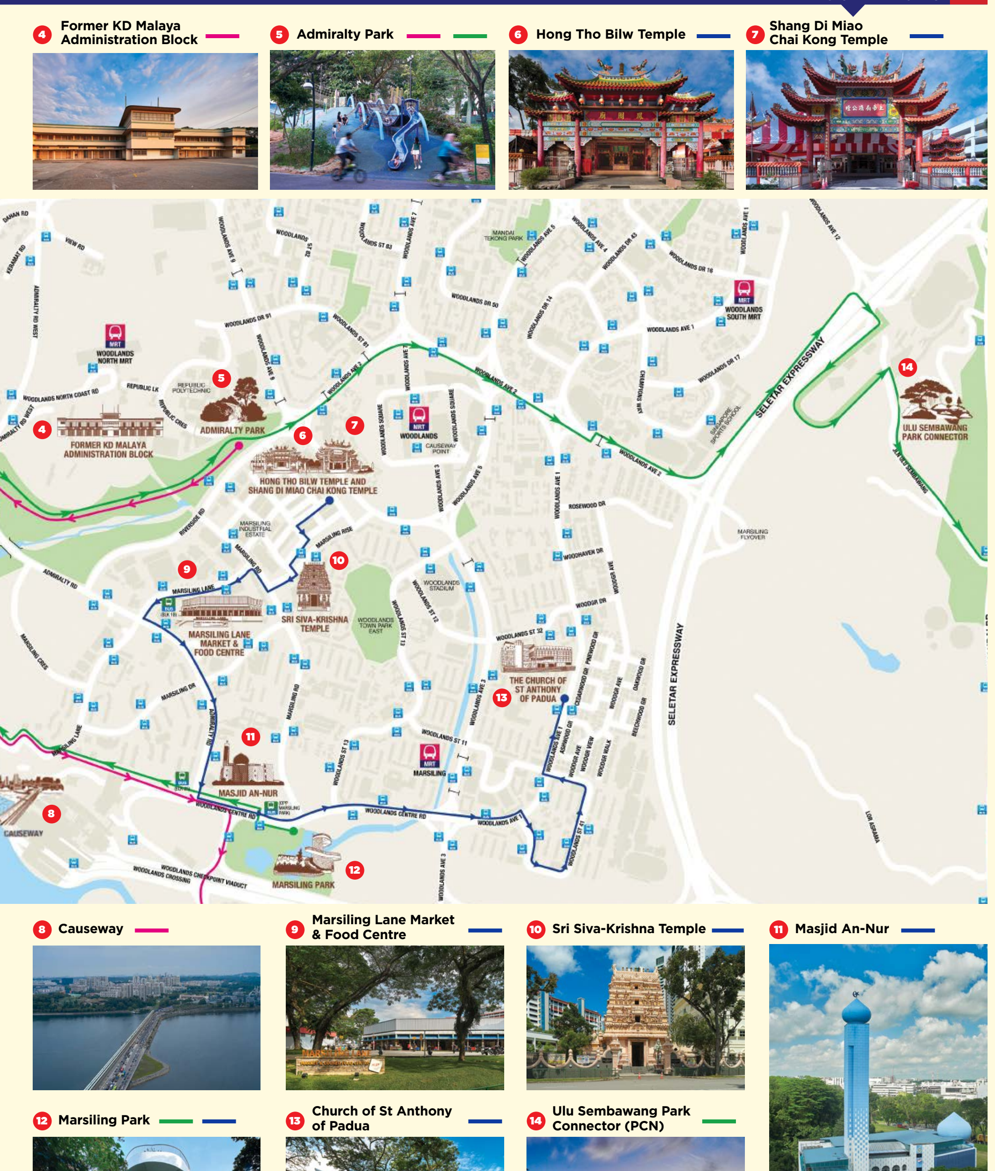
Information and photos by NHB